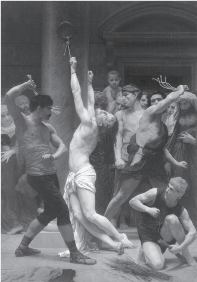
William Bouguereau, Flagellation de Notre Seigneur Jesus Christ (1880)

Let the heavens and earth stand astestruck to behold Him who swayeth the rod of fire, Himself smitten with scourges, to behold Him who spread over the earth the veil of the skies and who set fast the foundations of the mountains, who poised the earth over the waters and sent down the blazing lightning- flash, now beaten by infamous wretches over a stone pillar that His own word had created